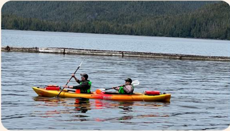
Two of our guests enjoying the new 2022 tandem kayaks