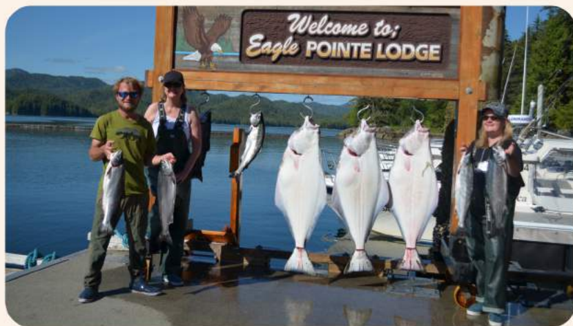
It was one "Halibut" of a day for all!

The weather was the best we have seen in well over a decade with an abundance of hot sunny days. In combination with moderate summer winds, this provided for very comfortable fishing conditions. This contributed to very few days this season with any restrictions on fishing grounds that we were able to venture to.