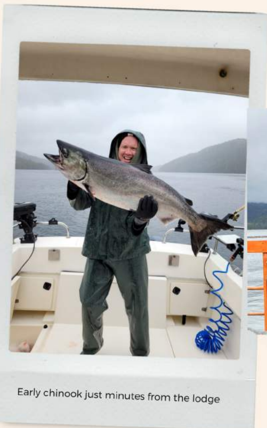
Early chinook just minutes from the lodge