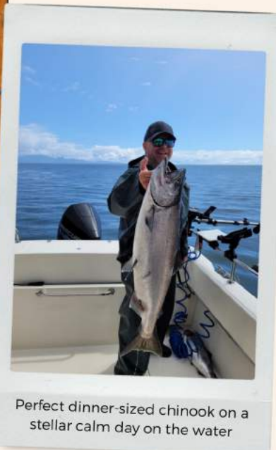
Perfect dinner-sized chinook on a stellar calm day on the water