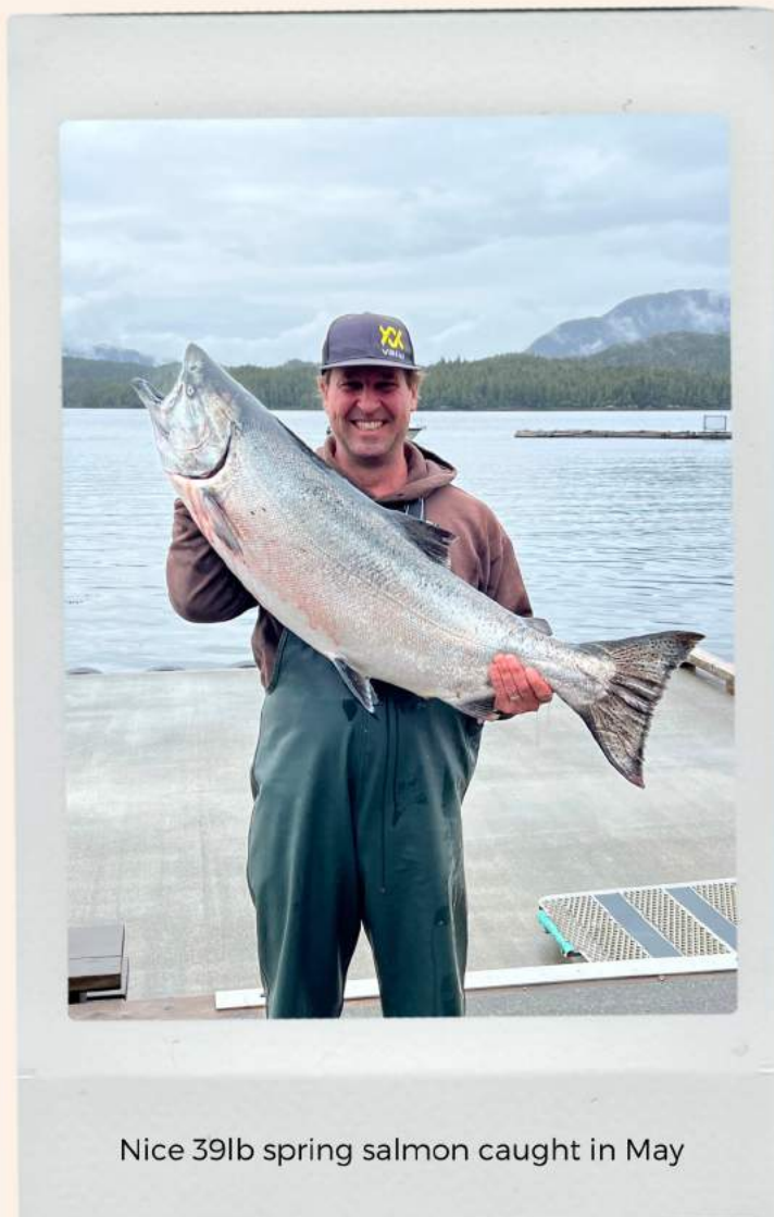
Nice 39lb spring salmon caught in May

It is always nice to fish so close to home with some of our favorite fishing spots producing big chinooks just a short 10-20-minute boat ride from the lodge. Limits at this time of year allowed for 2 chinook per day and 4 in possession. Fisheries continued with this right until mid-June which was very fortunate for our guests during early season.