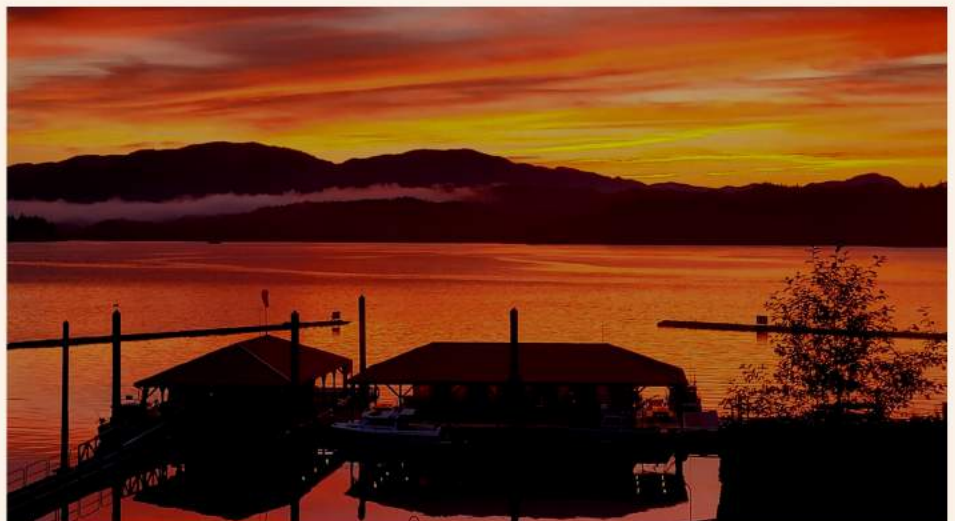
Incredible skies to look out at for a relaxing evening

The pristine wilderness around us made for some fascinating scenic tours this month. Taking in the sights of grizzly bears and black bears seen along the shorelines grazing and clam digging. It is exciting when we have the possibility of seeing deer or wolves swimming across channels and bonus additions of wildlife anywhere. Humpback feeding and breaching, killer whales, porpoises, sea lions, harbor seals and sea otters were seen by many. Some were even right off our dock where an abundance of eagles are usually feeding.