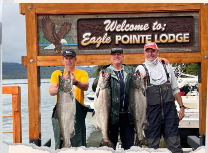
Three happy guys with three beauty spring salmon