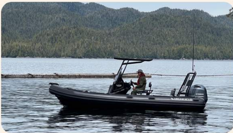
Our new Highfield 2022 Zodiac