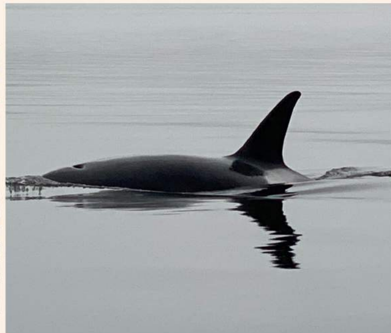
Sights caught straight off our dock as guests began to venture out for the day on the water