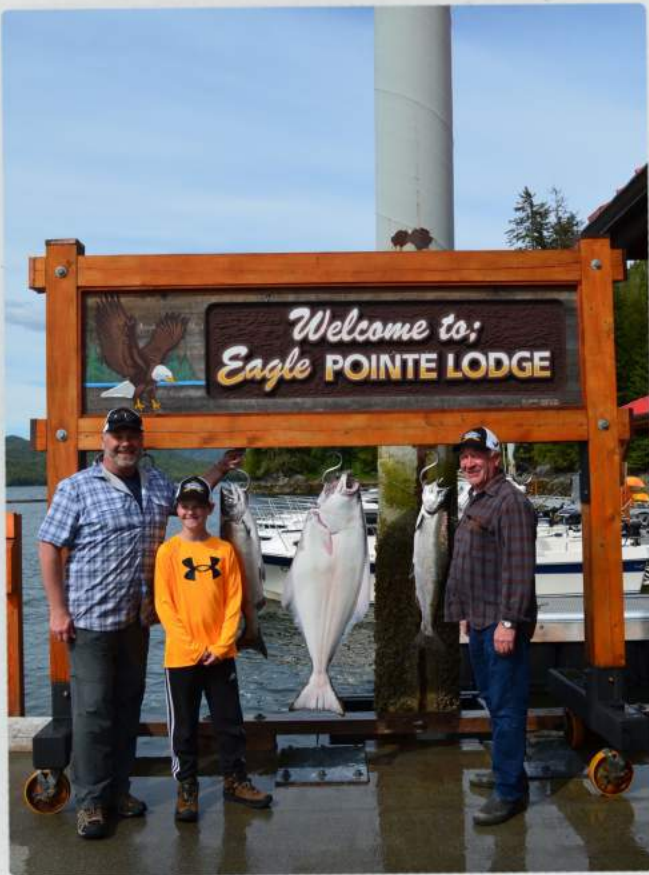
Three generations - Great family and friends trip = a lifetime of memories

The first coho did not arrive until mid-June and slowly trickled in. Thankfully the bottom fish, halibut, lingcod, and rock fish were usually quite active and willing to give us some fun and good eats. It doesn't always have to be about filling the box as we are so fortunate to be in such breathtaking scenery and enjoying friends and family in the ultimate paradise.