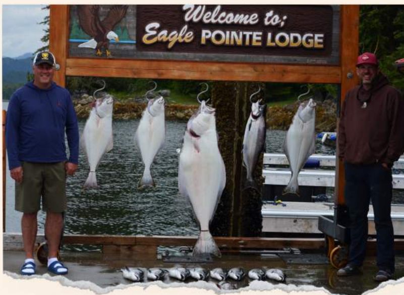
Nice productive day of fishing. Taking home coho, halibut and lingcod

There were still several out there for a nice gentle catch and release. Thankfully, the coho's were hot and heavy to be sure guests got to fill their boxes with their full limits of salmon to take home.