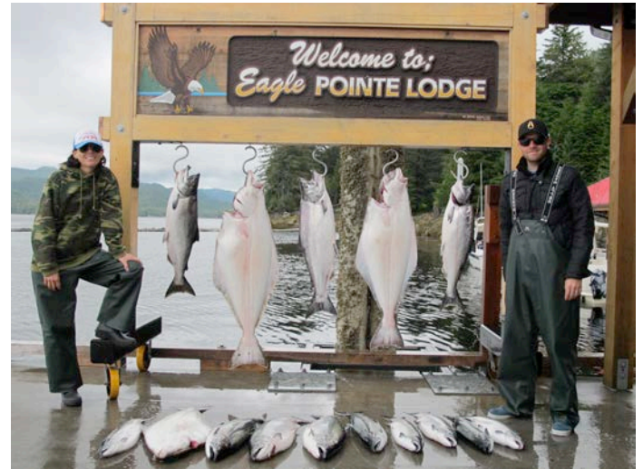
Welcome to what August has to offer.

On behalf of the ownership and staff, we wish everybody a safe and healthy winter season and look forward to seeing you all next summer.