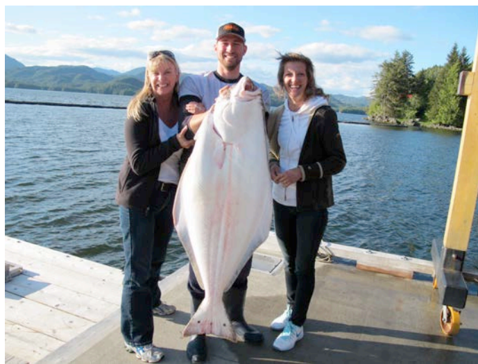
Lady Luck is the best luck to have. At 132 cm, this halibut is 1 cm under the legal limit.

The overall size and volume of halibut that were hungrily cruising around looking for a meal was impressive. The new halibut size restrictions that fisheries implemented several years ago seem to be working well for both us and the halibut.