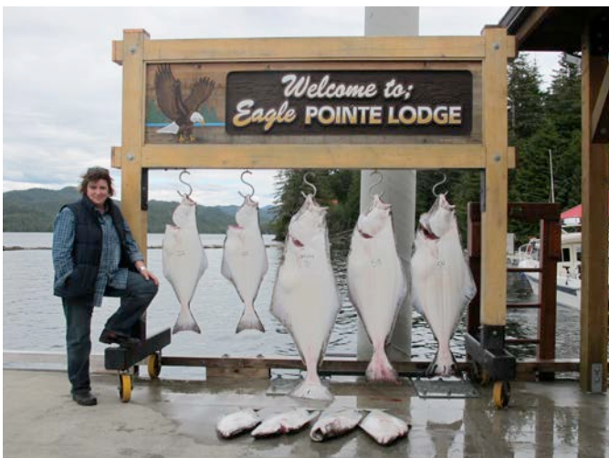
Lynn Crawford and an impressive haul of halibut.