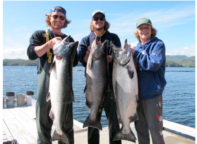
Stellar day for the boys with some large Springs.

In turn, the distinct possibility of hooking a trophy is always present which happens every year. As summer progressed this past year, we were quite lucky with the weather and water conditions. Zayas Island turned out to be the place where most of the guides directed their boats to in late July and August.