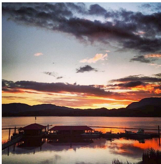
Amazing sunset at EPL.

Another season has come to an end up at Eagle Pointe Lodge and we can sit back with fond memories of the splendor that took place this summer. To try and put the 2014 fishing season down onto a single newsletter can be a bit of a daunting task as there are countless memories that come flooding back.