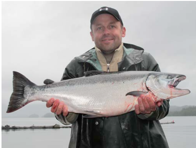
A prime August Coho.